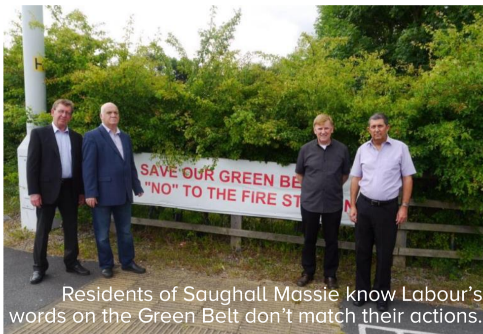
Residents of Saughall Massie know Labour's words on the Green Belt don't match their actions.

For more information and to have your say, visit our website: wirralconservatives.com/greenbelt