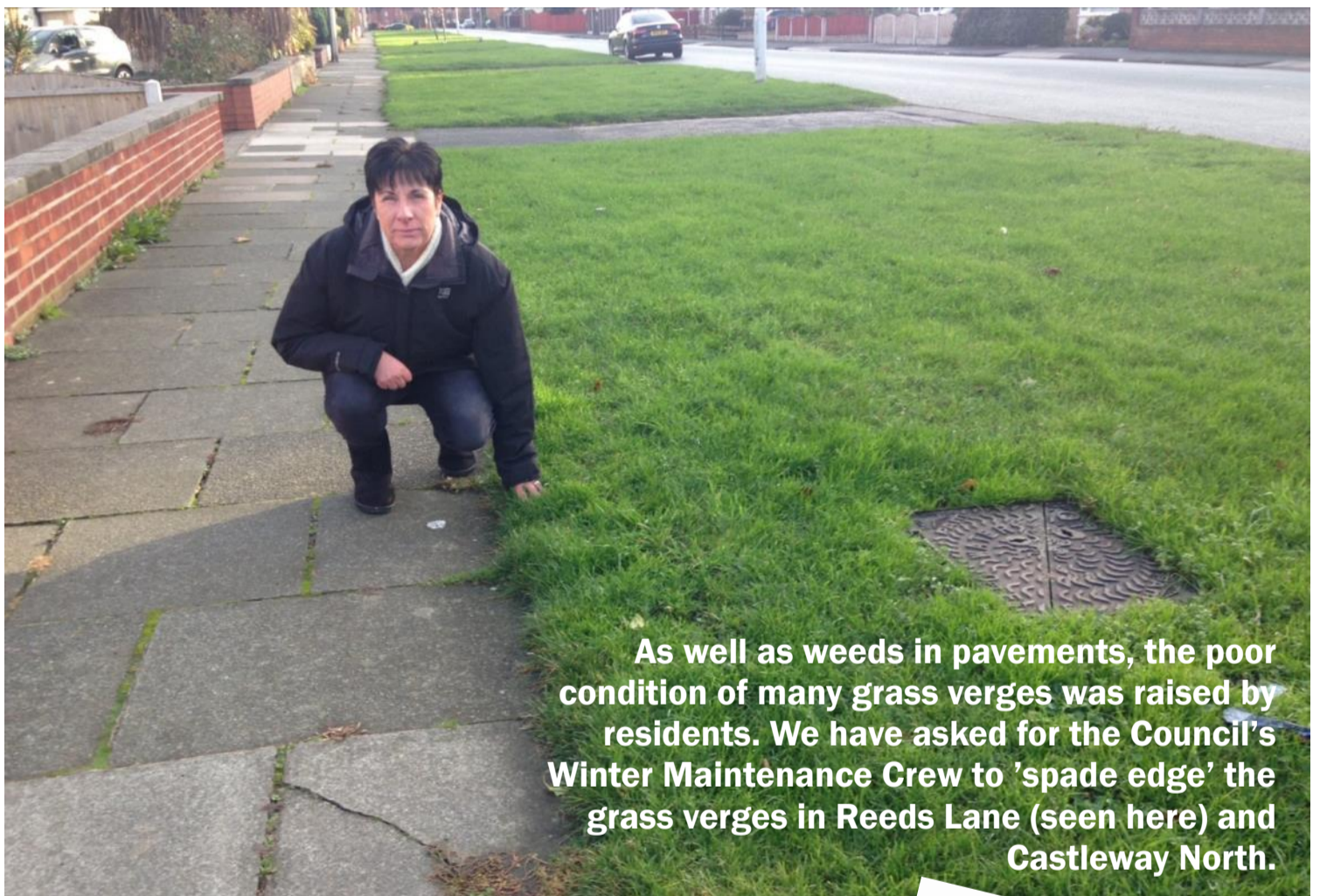
As well as weeds in pavements, the poor condition of many grass verges was raised by residents. We have asked for the Council's Winter Maintenance Crew to 'spade edge' the grass verges in Reeds Lane (seen here) and Castleway North.