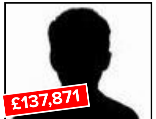
Director of Transformation