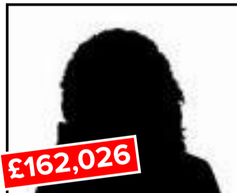
Director for Strategy & Partnerships