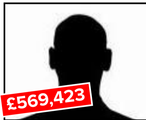
Managing Director for Delivery