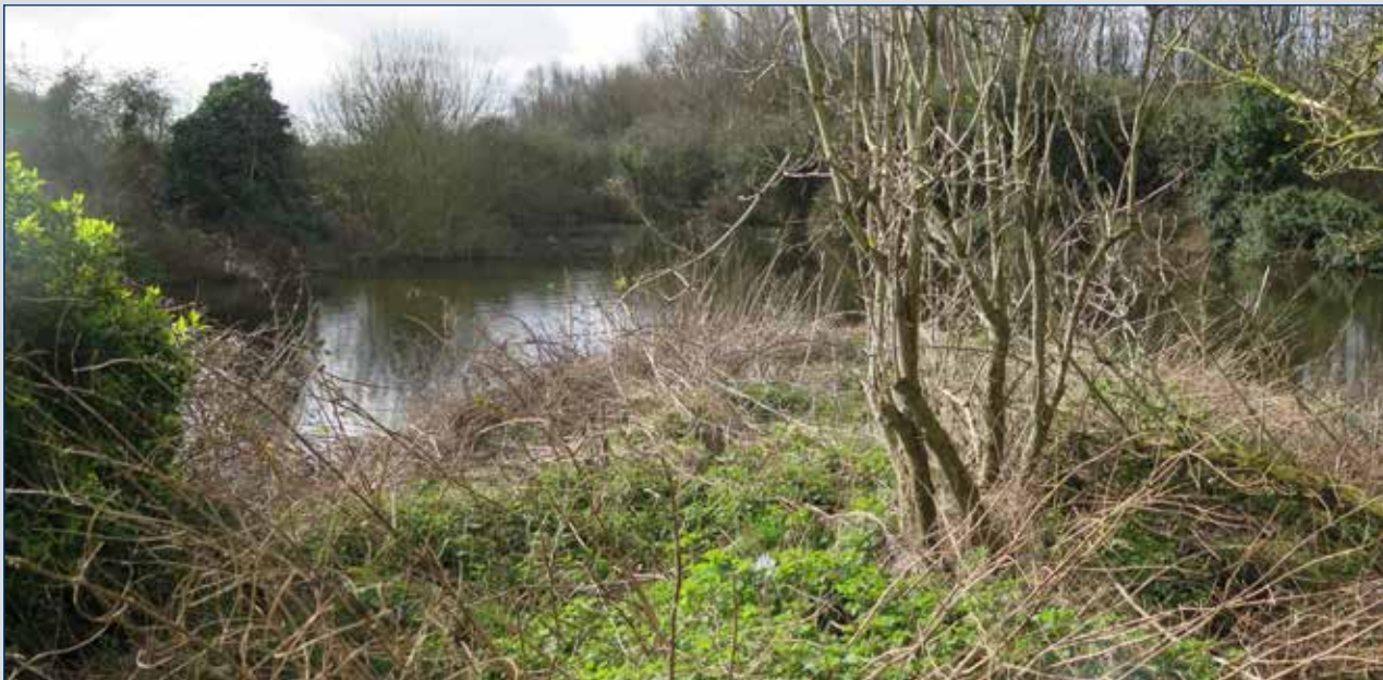
Jenny's Wood at the rear of Littlemore Close