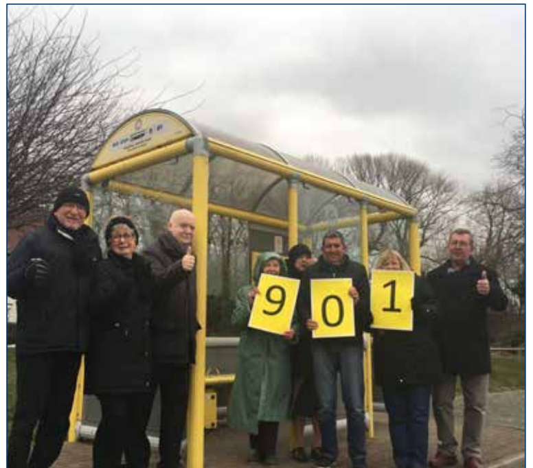
Councillors and residents protesting about losing the 901 Route